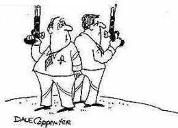
"This is not the kind of 'out of court settlement' I had in mind."