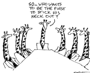
Giraffe mediator breaks ice with lame joke.